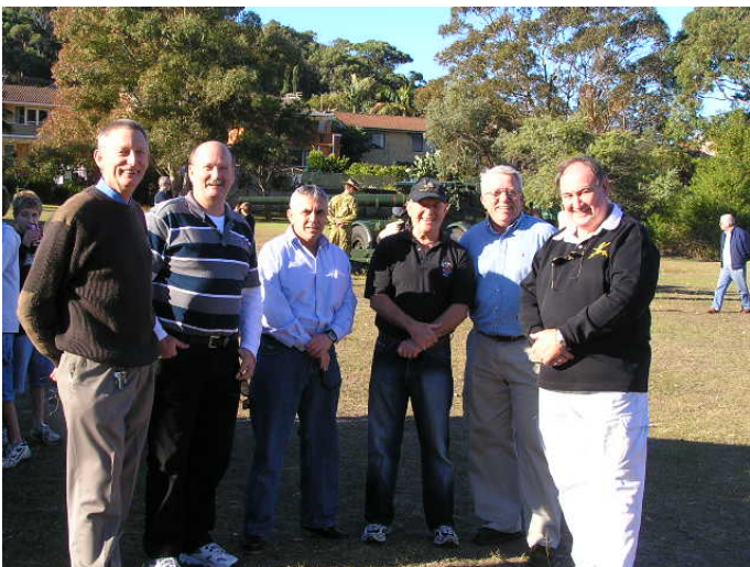
50 th Anniversary of the Opening of Dee Why 24 Jun 06